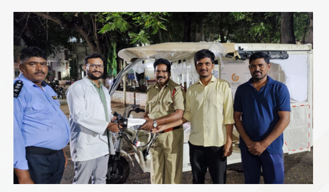
Electric Vehicle Donation to NIMS supported by Qvantel