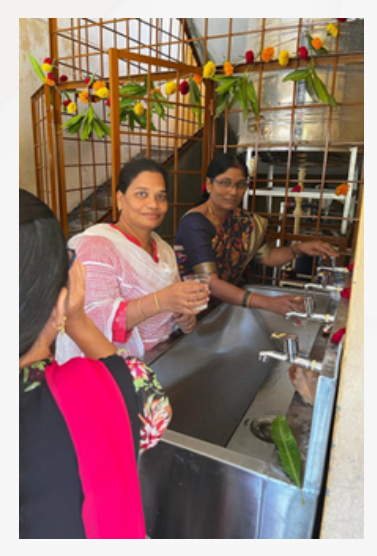
Drinking water setup