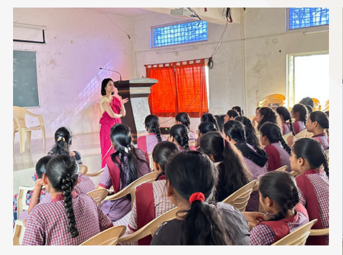
Interactive session at TTWRDC