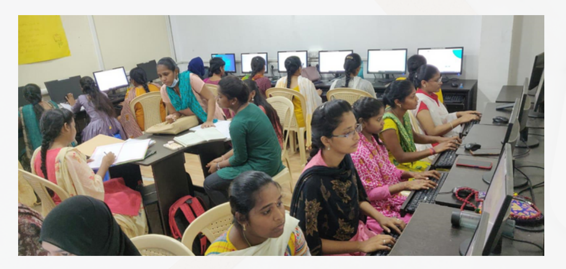
Students undergoing training at Fatehnagar Center