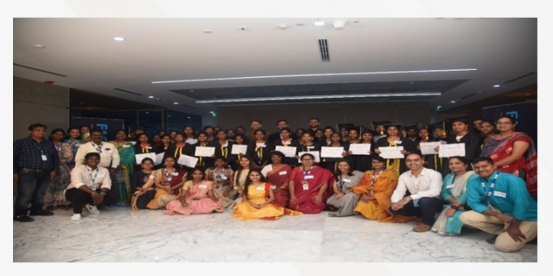
We celebrated our students' training completion with a graduation ceremony at FactSet Office, where they interacted with core employees

Women from the economically backward community are given training in "Web and mobile applications" to empower them. The goal of this project is to train and place unemployed women from underprivileged communities as per market requirements and help to achieve their own goals. Program implementation begins from identifying the needy women who are looking for training & placement assistance. Community Mobilizers visit the community on a regular basis and interact with women and their parents to create awareness of women in technology programs and help them enroll in the program. 8720 have received training through this program and out of them, 1104 have been placed.