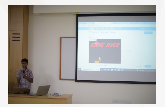
students displaying their inventions through Coding