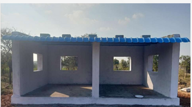
Garbage Collection, Segregation And Disposal Systems