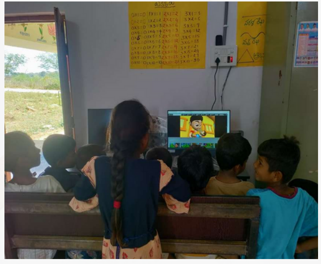
Availability of IT-enabed classrooms