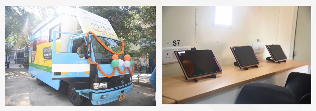
Inauguration of mobile VHL

Under VHL, this year with our 33 projects, we have impacted 206538 students.