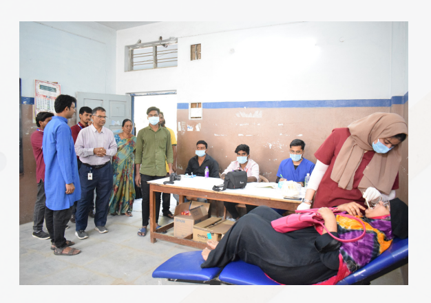
Patients undertaking check-ups

Providing access to healthcare is crucial for the overall well-being of individuals and communities. We have conducted 14 Multi speciality Free health camps in and around Hyderabad, Ranga reddy and Vijayawada impacting 6521 patients.