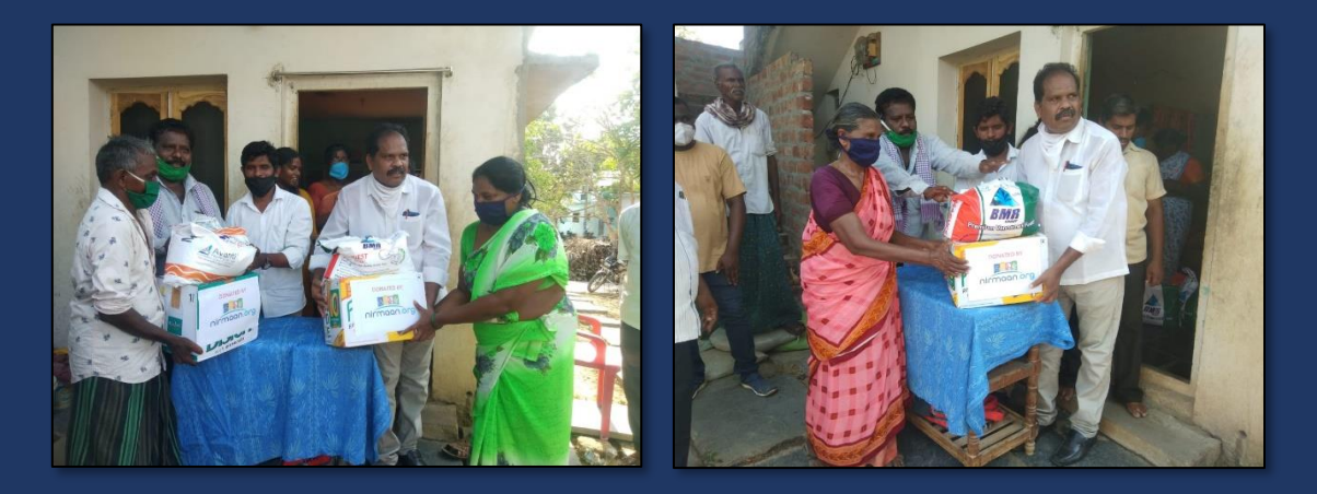
Nirmaan Vidya HelpLine (VHL) team members distributing 'Ration Kits' to the villagers in Mallepadu Village, Andhra Pradesh

We heartily thank SEBI (Securities & Exchange Board of India), Stock Exchanges, Depository teams in Hyderabad & Vijayawada for their contribution!!