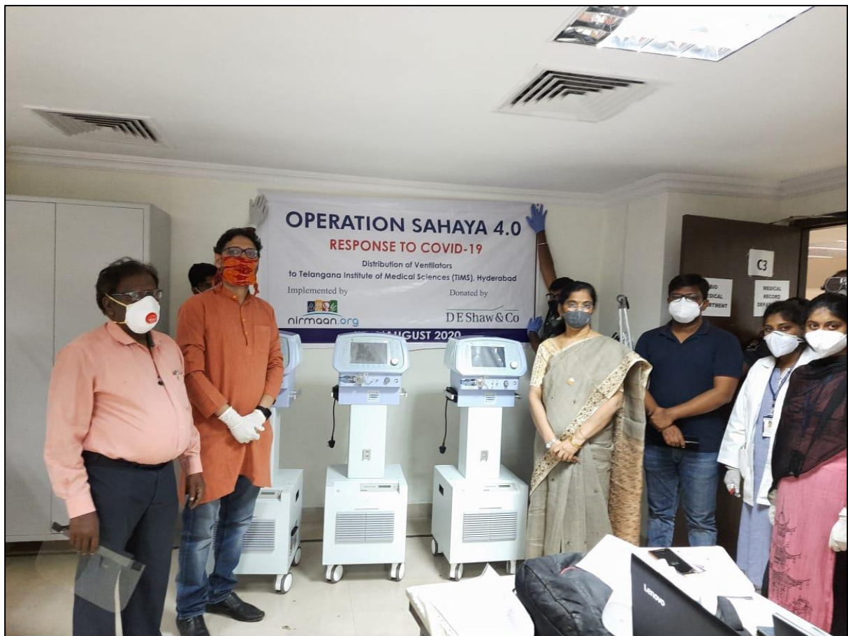
Ventilators donated to Telangana Institute of Medical Sciences (TIMS), Govt of Telangana

The Management of TIMS felt happy and appreciated the efforts of Nirmaan and expressed their sincere thanks to D.E. Shaw India Pvt. Ltd. and EPAM Systems for their support!!