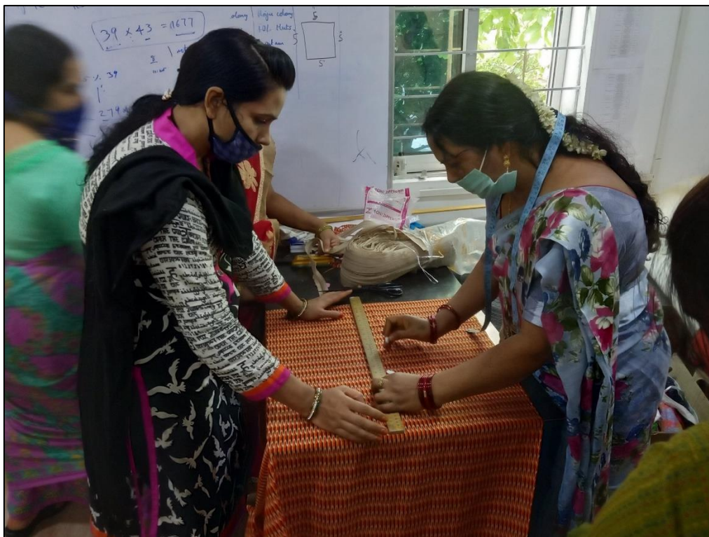
Bag Making TOT session for Trainers at Vocational Training Centers for Women, Skill Development & Entrepreneurship team