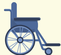
1 Electric vehicle & 63 wheelchairs