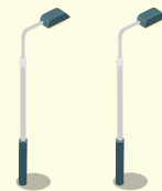
Installation of Street Lights