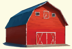
Construction of Cattle Sheds