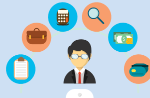
Basic accounting skills