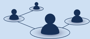
Connecting Beneficiaries With Vendors