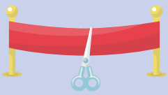
Inauguration of Hope In a Cup Café