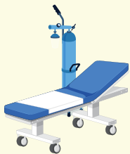
50 Stretcher with cylinder stand