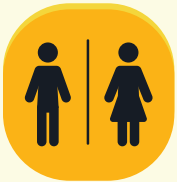
Construction of Community Toilets