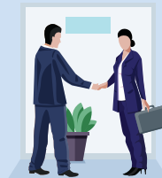
Company Exposure Visits