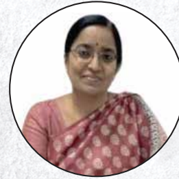
SANDHYA RANI IPoS (Rtd.), Former Commissioner of Education, Govt of Andhra Pradesh