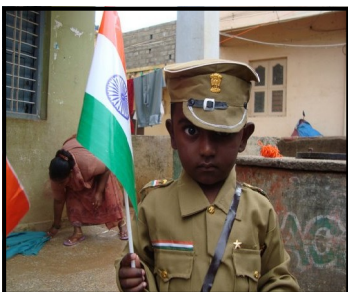
The Dynamic Generation Next!! - A kid during flag hoisting at Kannada School.